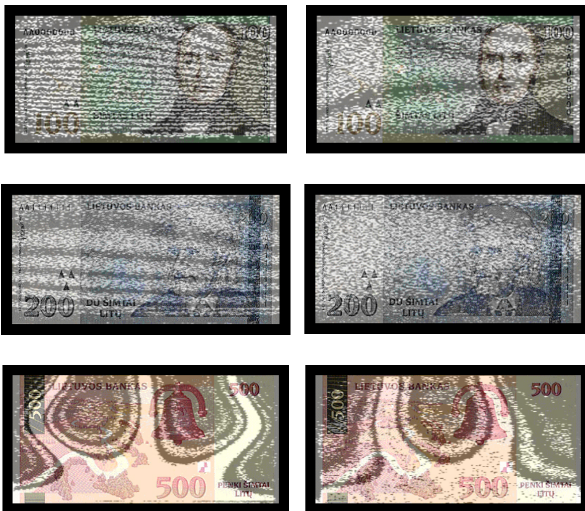
Fig. 3. Holographic interferograms of Litas banknotes

Naturally every experimental analysis method has its strengths and drawbacks. A certain drawback of the presented methodology is that the analyzed banknote samples must be new. If the banknotes are used, the mechanical properties of the banknotes are altered and the detection of falsifications is much more complicated. Nevertheless, this fact does not lessen the practical value of the method and can be successfully applied for identification of falsifications of different treasure papers.